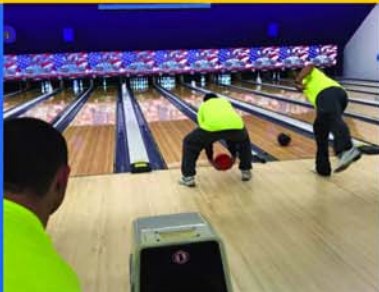
Special Needs Programs