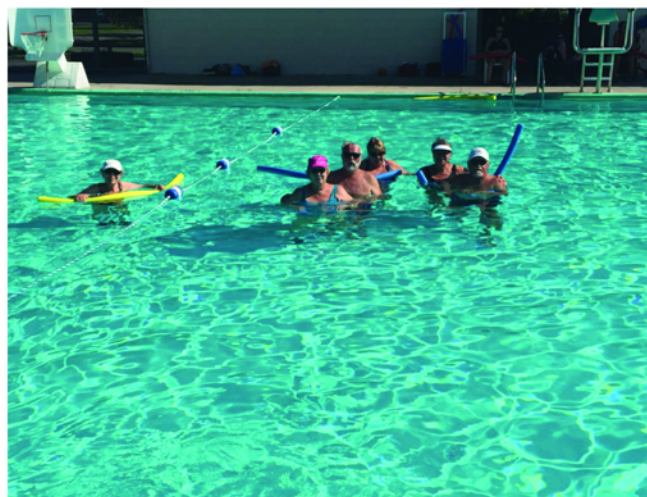
Drennan Pool offers Adult Swim Mondays through Fridays from 4-5pm.

Non-Residents: $5.00 per person, including children. Pool Passes may be purchased at $10 per week or $30 for summer.