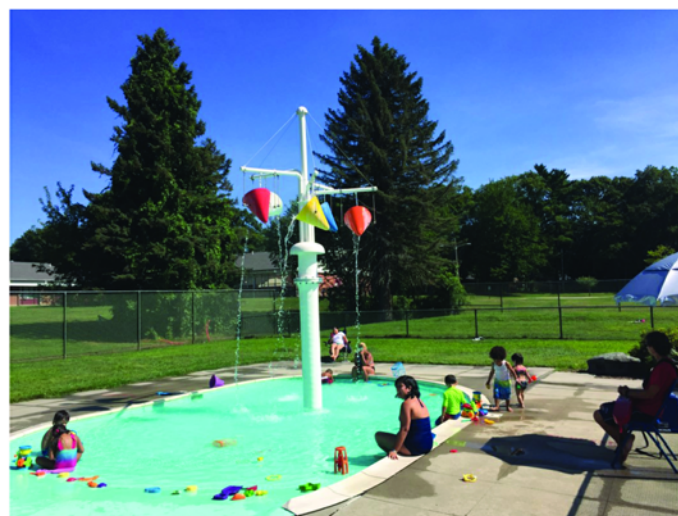
The wading pool at Lord Pool is a great place for little ones to cool off!

*Candidates who successfully complete the course and work for us as a lifeguard this summer will receive a $100 rebate at the end of the summer! Employment is not guaranteed. Candidates must work the entire summer. Scholarships may be available.