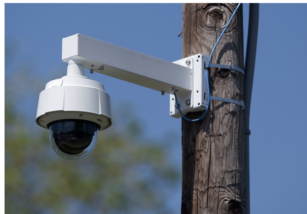
Above: A pole mounted camera gives police staff video of real-time traffic conditions.

The East Hartford Fire Department is the primary medical responder in town and does carry Narcan, but there are times officers are on-scene first. Our officers will soon also be able to administer this lifesaving medicine in the field.