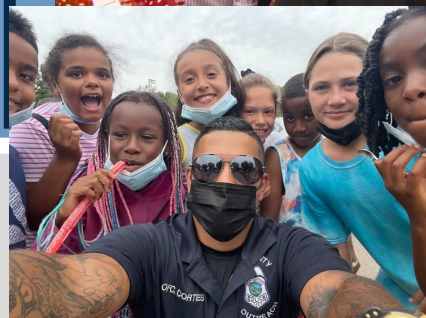
Above, EHPD Officers and store staff from Dunkin Donuts greet citizens on National Coffee with a Cop Day