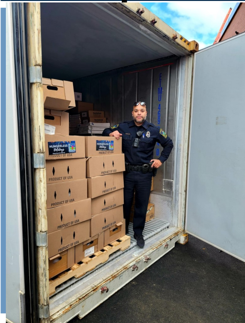
EHPD Officers participated in the 2021 Turkey Distribution at East Hartford High School

During 2021, the EHPD adapted our participation in events to ways that would allow for social distancing and safety precautions to be taken, while still helping the community. Above, EHPD hosted a “mobile National Night Out”, traveling to Gorman Park, Hockanum Park, Martin Park, and Labor Field to meet citizen and share food, games and music.