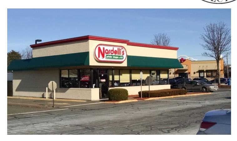
Nardelli's – Putnam Bridge Plaza