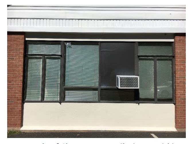
Example of Classroom Ventilation at Pitkin

Pitkin Elementary School was constructed in 1966, and as typical with schools built in that era, exterior windows (natural ventilation) provide the only source of fresh air to classrooms as the building lacks a modern ventilation system. The exaust fans which are of original design to the building only function to "exaust" air out of these spaces. During the heating/cooling season when windows are typically closed, significant reductions in fresh air make-up for classrooms are experienced as more air is "exausted" with little to no fresh air introduced contributing to poor indoor air quality. During milder "shoulder" seasons when