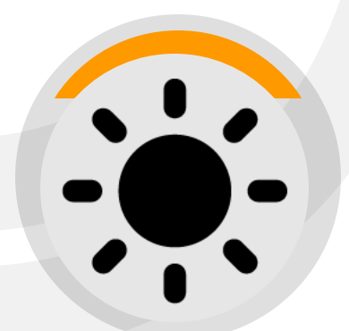
Summer Program, 705