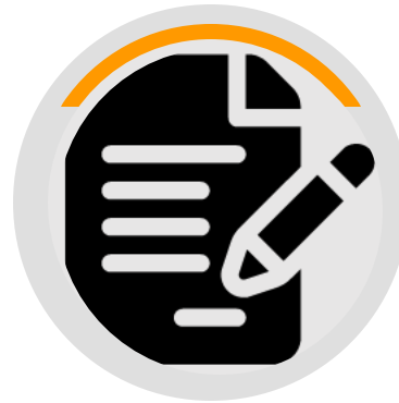
New Software 2275