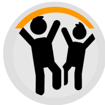
Clean up Days