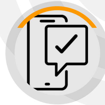
Youth IDs 385