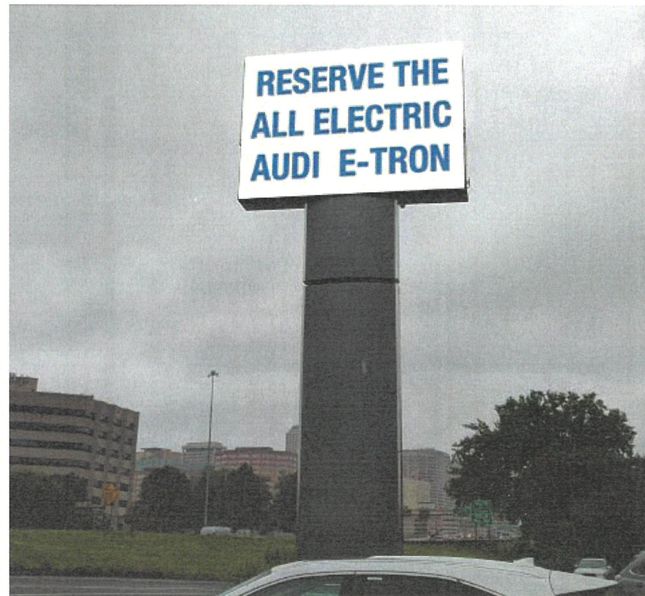
Proposed New Signage