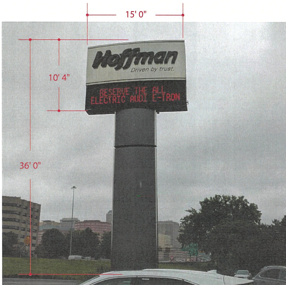
Existing Old Signage